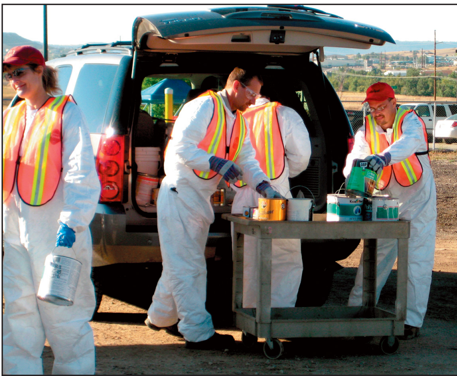
We unload everything, so you don't even have to get out of your car!

Open to all residents of Unincorporated Adams County and the Cities of Brighton, Commerce City, Federal Heights and Thornton. (Aurora and Westminster have their own disposal programs.) Please bring a utility bill, phone bill or driver's license to verify your address. A contribution of $25 is requested to help offset the high cost of hazardous waste disposal.