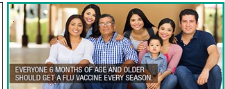
EVERYONE 6 MONTHS OF AGE AND OLDER SHOULD GET A FLU VACCINE EVERY SEASON.

Our TCHD after hours contact number has changed! Please update your contacts to the new number: 720-200-1486