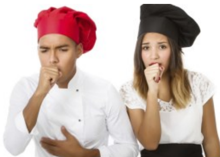
Persistent Coughing and Sneezing