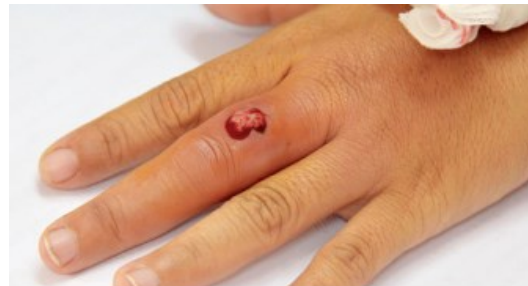
Infected or Open Wounds