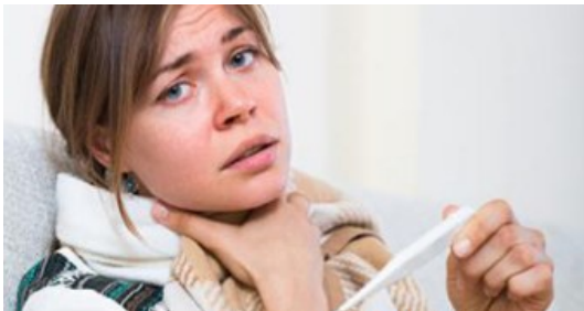
Fever with a Sore Throat